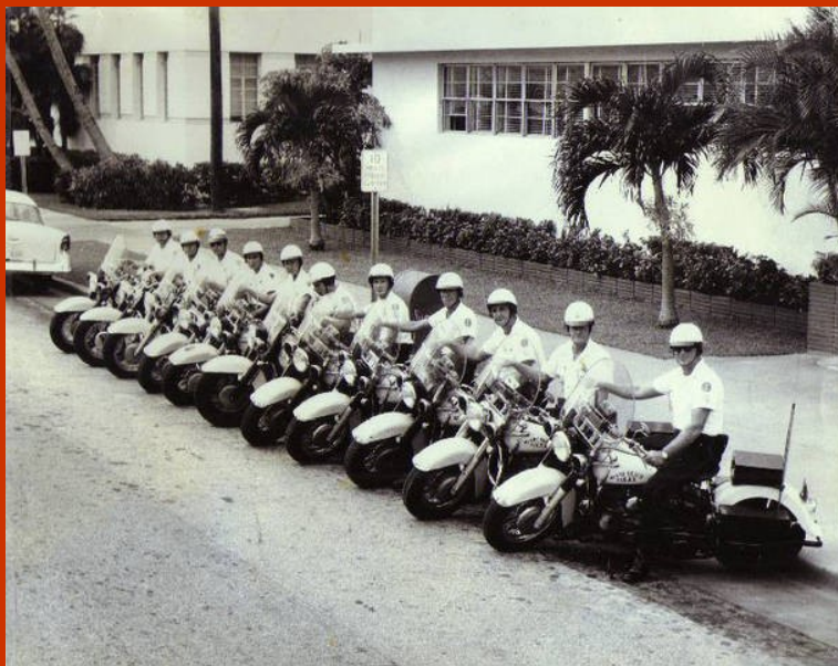
"MBPD Motor Squad, 1960's"