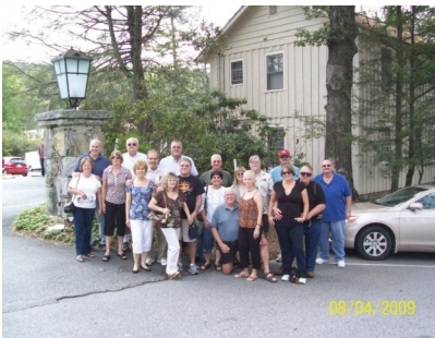
Lunch at The Highlands