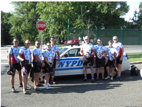
Tour de Force Memorial Bike Ride

This annual 4 day ride will kick off this year in Boston on September 11 th , and travel through Massachusetts, Connecticut, Long Island and end at Ground Zero in New York City. They will ride a total of 250 miles. More than 150 Police Officers are expected to ride this year.