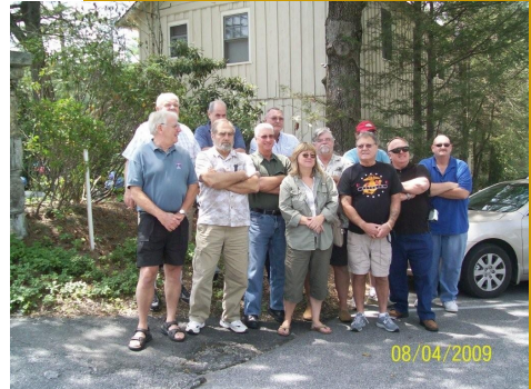
Lunch at The Highlands

grateful they had made it through some of the most dangerous times Miami Beach had ever experienced.